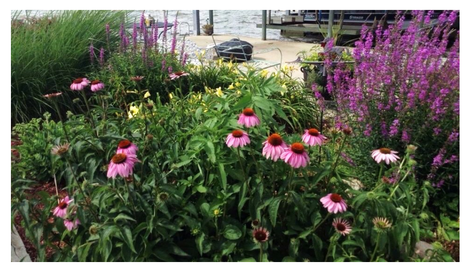
Switchgrass, Purple Cone Flower, Sneezeweed, Spiked Blazing Star