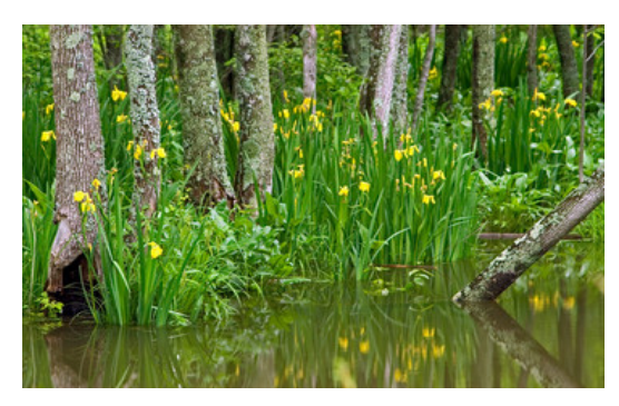
Yellow Flag Iris Flowers in Wetland (Beware of Invasive Species) (Lamoureux)

USDA advocates alternatives to stone riprap for erosion control. Some of these are wattles, gabion baskets, GreeneArmor, fiber tubes and hydroseeding. (USDA NRCS 32) Hydroseed is a form of bio engineering and is useful for both stream banks stabilization and filtering strips (SCS 5). Bioengineering reduces the cost and impact on the environment. "...Root systems reinforce the soil mantel and remove excess moisture from the soil" (WSDOT)