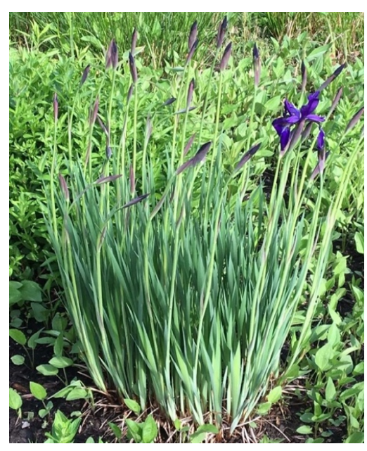
Purple Flag Iris