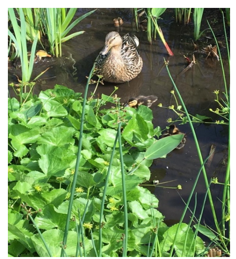
Alternative riprap methods are friendly to wildlife.

The technique of streambank bioengineering focuses on utilizing natural living structural components for bank stabilization and erosion control (USDA NRCS 54). Some of the most common components of bioengineering recommend the use of woody plants and grass vegetation. Purposes include slowing water velocity and preventing transportation of sediment, unwanted nutrients and soil drainage into the lake. As opposed to stone riprap, the technique of streambank bioengineering is more friendly to local wildlife habitat and can be a good attractant for wildlife and fish. Living riprap alternatives have added benefits for those who live on a lake and enjoy fishing. (SCS 5, USDA NRCS 4,5).