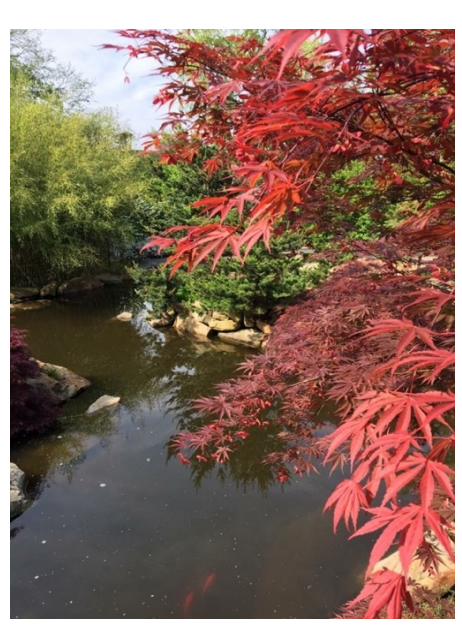
The Beauty of Alternative Riprap Methods