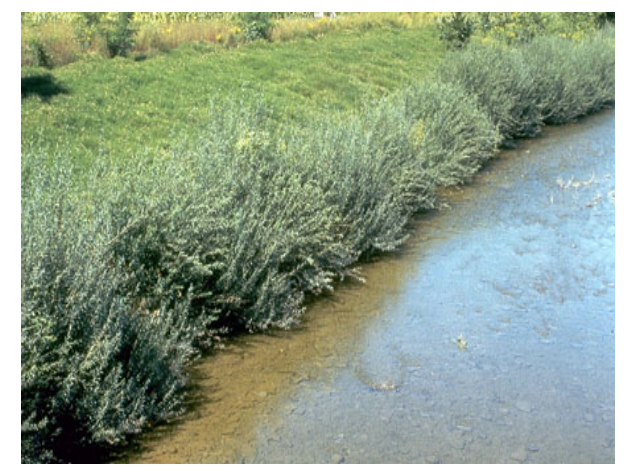
Salix Purpurea "Streamco" Willows (Bluestem Nursery)

Methods for planting living erosion control include use of living plants or the use of dormant woody cuttings, stakes or posts. Plants may also be used in conjunction with other erosion control structures such as riprap or gabion baskets.