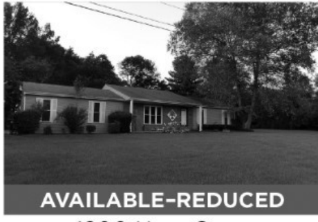
1200 Harz Cove