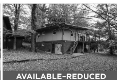
1232 Lorelei Drive