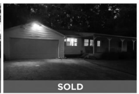
1747 Lorelei Drive