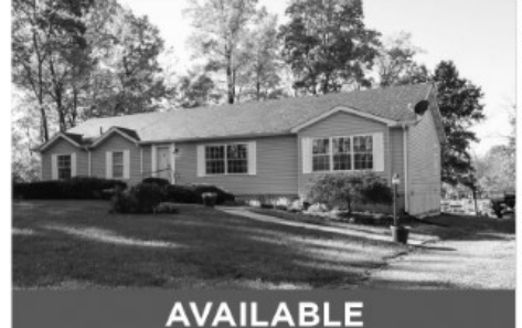
1207 Lorelei Drive