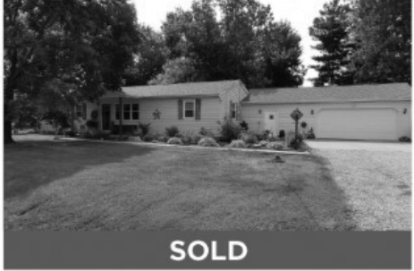
1361 Wagner Drive