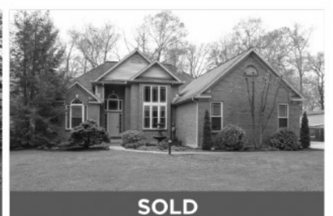
299 Bremen Drive